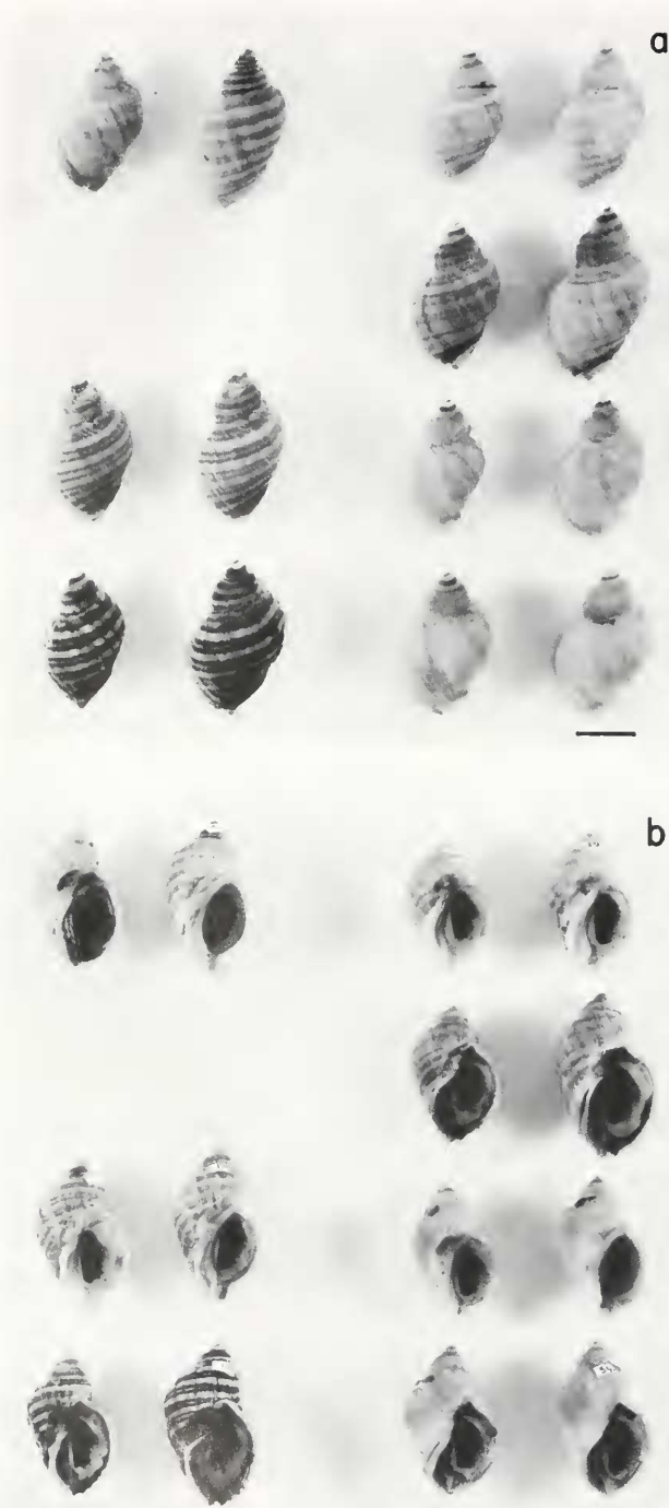
FIGURE 2. Possible evidence for pleiotropy: pigmentation and banding phenotypes from clutch 82-52-1A in Thais emarginata . (a) abapertural view, (b) apertural view of the same individuals. Columns 1 and 2: row 1—male parent = light grey shell with tan mottling and white lip, hint of banding, purple columella, female parent = yellow-orange shell and lip, banded, orange columella; row 3—both individuals intense